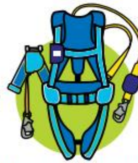
Purchase new, upgraded qualifying** 3M Fall Protection products