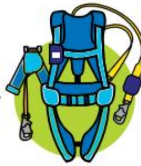
Purchase comparable qualifying* 3M Fall Protection products