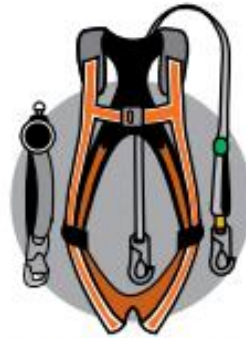
Trade in competitive fall protection products