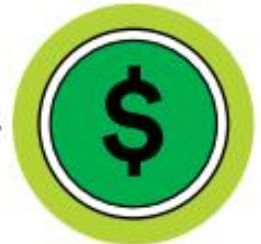
Receive a cash rebate