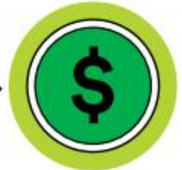
Receive a cash rebate