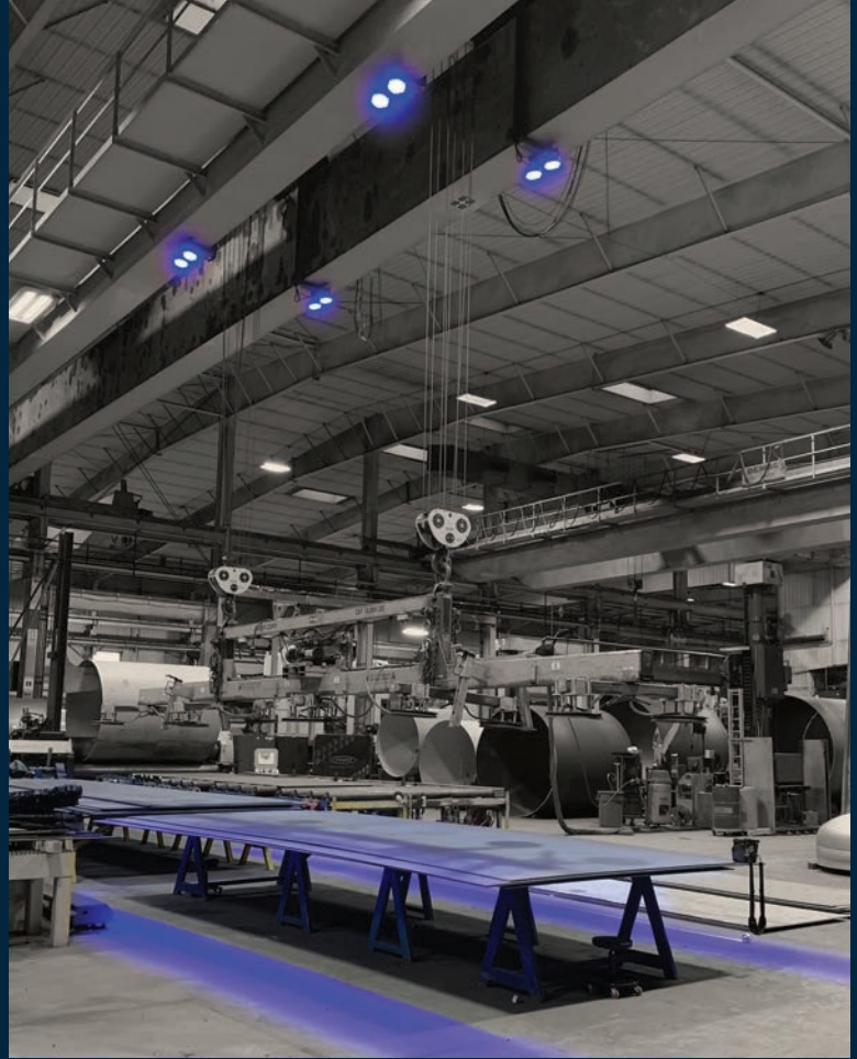
Photos show blue laser-lighted caution areas around equipment.