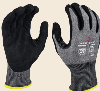
RADRWG589 Cut Protection Level A9 Sandy Foam Nitrile Coated Glove XS-2XL $9 99