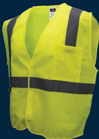
RADSV2 Economy Type R Class 2 Mesh Safety Vest Hi-Vis Green or Orange S-5XL $5 89

* $1.50 IMPRINT FEE PER SINGLE COLOR LOGO. NO SET-UP FEE. MINIMUM ORDER APPLIES. CONTACT YOUR SALESPERSON FOR PRICING.