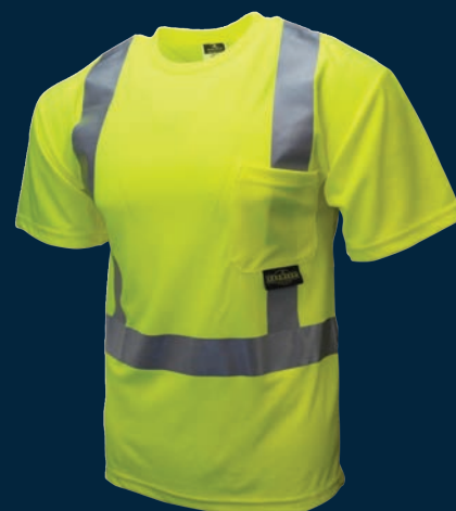
RADST11-2 Class 2 High Visibility Safety T-Shirt with Max-Dri™ Hi-Vis Green or Orange S-5XL $11 89