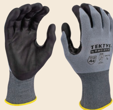
RADRWG708 TEKTYE® A4 Reinforced Thumb Work Glove XS-2XL $8 99