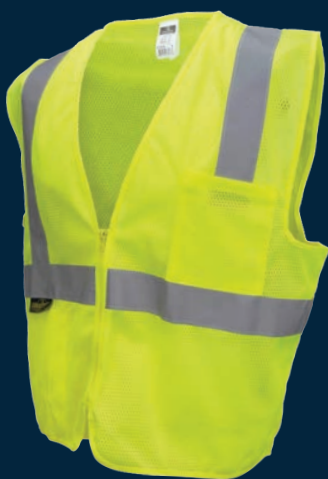
RADSV2Z Economy Type R Class 2 Mesh Safety Vest with Zipper Hi-Vis Green or Orange S-5XL $6 89