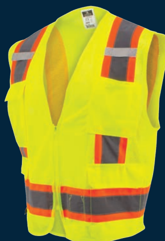
RADSV6 Two Tone Surveyor Type R Class 2 Mesh Safety Vest Hi-Vis Green or Orange S-5XL $14 99