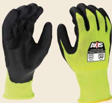
RADRWG564 AXIS™ Cut Protection Level A4 High Visibility Work Glove S-2XL $6 99